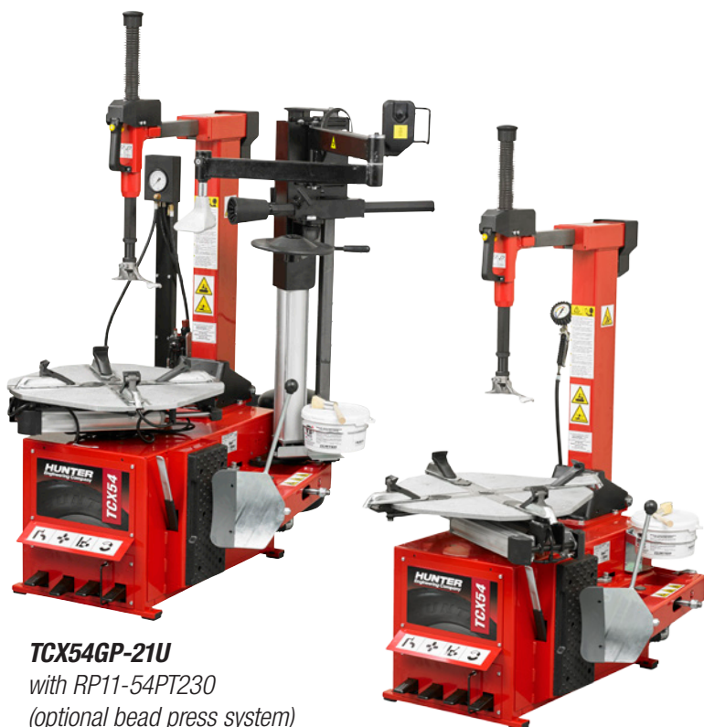
TCX54GP-21U with RP11-54PT230 (optional bead press system)

Some dimensions, capacities and specifications may vary depending on tire and wheel configurations.