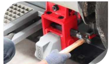
Slide the sill clamp