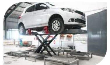
Fasten the sill clamp and raise the bench