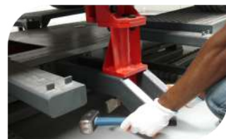
Slide the sill clamp