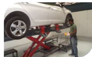
Fasten the sill clamp and raise the bench