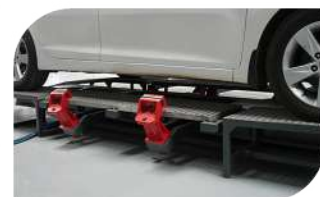
Drive the vehicle on the bench