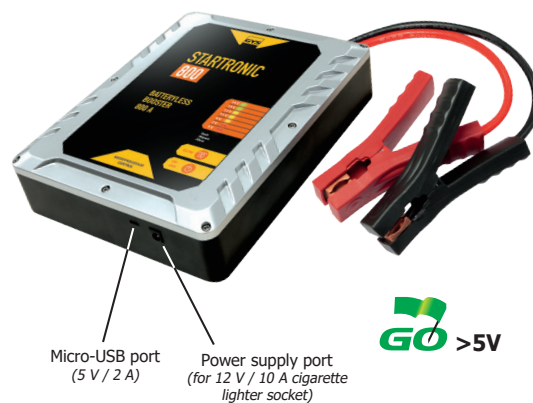
Micro-USB port (5 V / 2 A)